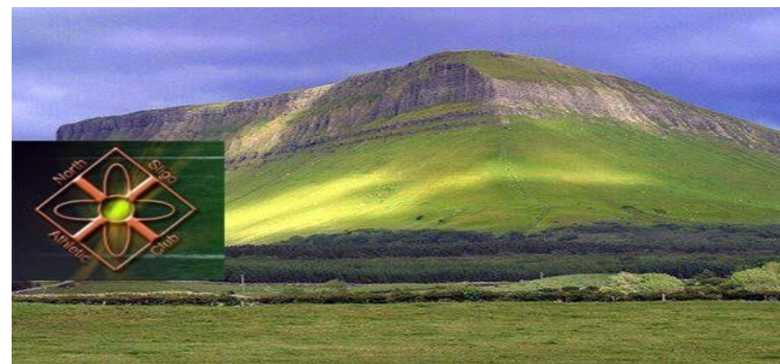
North Sligo Athletic Club