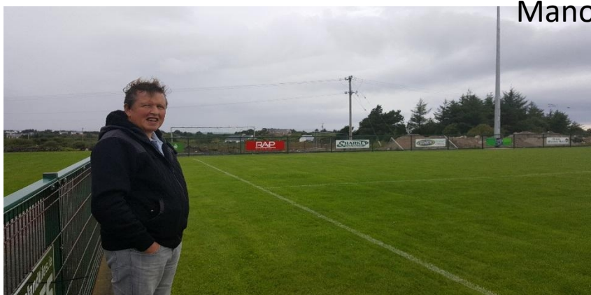
Gweedore Celtic FC, Donegal