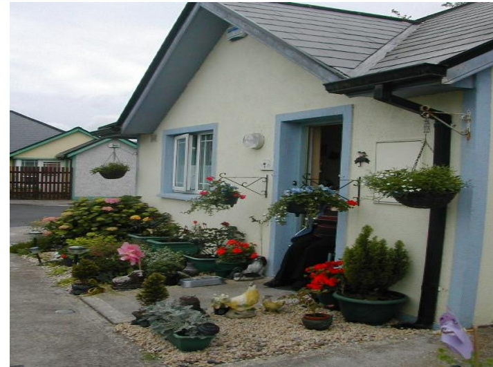
Clár IRD, Claremorris social housing development

Where every community is aware of the possibilities that Community Loan Finance offers