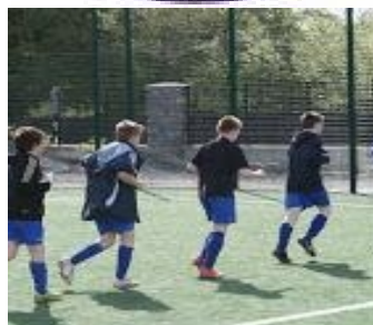
Manorhamilton Rangers FC