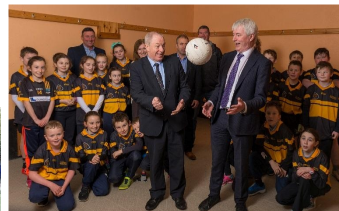
Louisburgh GAA, Mayo