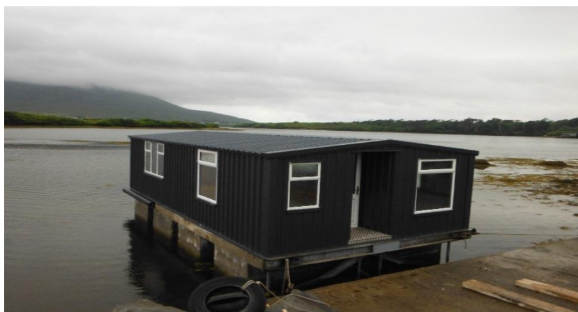
Bellacragher Bay Boat Club, Mayo